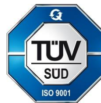
Michael Fernald Head of Central Certification Body Page 1 of 2

The certificate is valid from February 5, 2025 until February 4, 2028 With a re-issue date on N/A