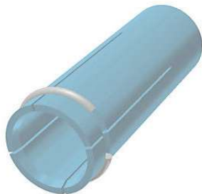
SEGMENTED FEMALE CONTACT

Segmented female contacts are used mainly for electric connectors and shielding applications in the automotive and other industries.