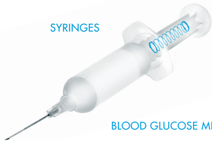
BLOOD GLUCOSE METERS